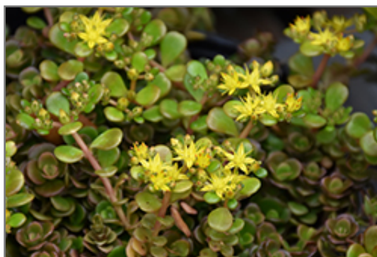
Chinese Sedum flowers