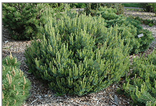
Beauvronensis Scotch Pine