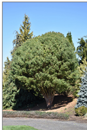
Beauvronensis Scotch Pine

Beauvronensis Scotch Pine is recommended for the following landscape applications;