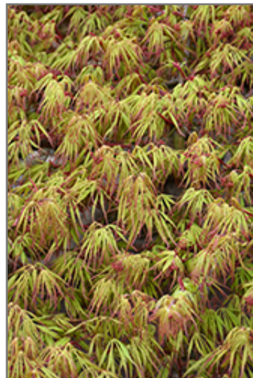
Spring Delight Japanese Maple foliage

Spring Delight Japanese Maple is recommended for the following landscape applications;