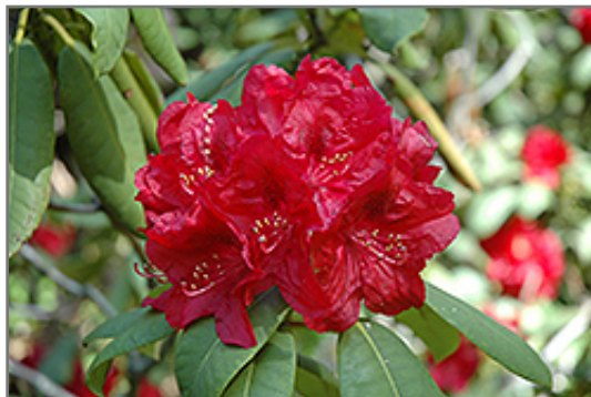
Henry's Red Rhododendron flowers

Henry's Red Rhododendron will grow to be about 5 feet tall at maturity, with a spread of 6 feet. It tends to be a little leggy, with a typical clearance of 1 foot from the ground, and is suitable for planting under power lines. It grows at a slow rate, and under ideal conditions can be expected to live for 40 years or more.