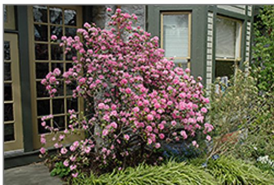
Olga Mezitt Rhododendron in bloom