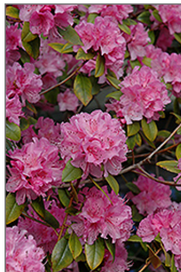
Olga Mezitt Rhododendron flowers