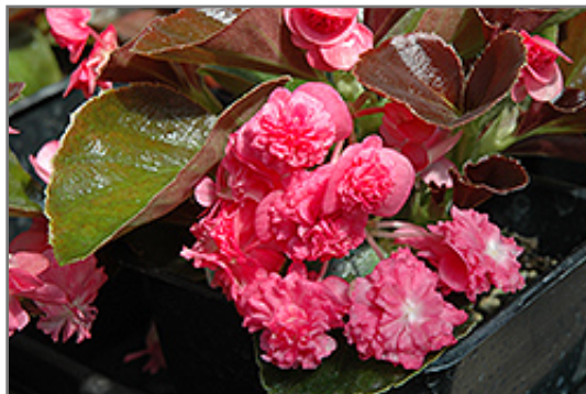
Doublet Rose Begonia flowers

This is a high maintenance plant that will require regular care and upkeep, and usually looks its best without pruning, although it will tolerate pruning. Deer don't particularly care for this plant and will usually leave it alone in favor of tastier treats. Gardeners should be aware of the following characteristic(s) that may warrant special consideration;