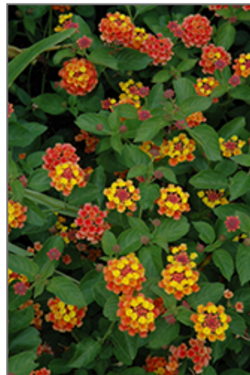
Landmark Citrus Lantana flowers