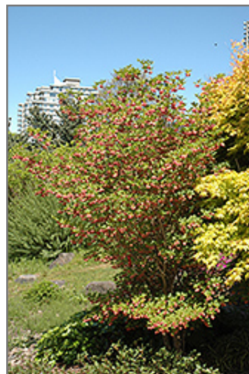
Redvein Enkianthus in bloom