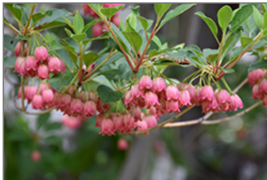
Redvein Enkianthus flowers

Redvein Enkianthus is recommended for the following landscape applications;