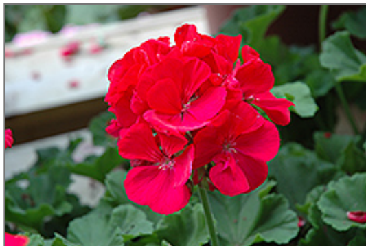
Rocky Mountain Magenta Geranium flowers

Rocky Mountain Magenta Geranium features bold balls of lightly-scented fuchsia flowers at the ends of the stems from late spring to early fall. The flowers are excellent for cutting. Its tomentose round palmate leaves remain green in color with prominent brown stripes throughout the year.