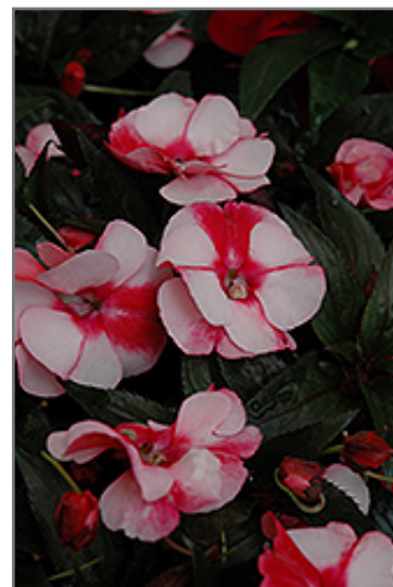
Sonic Sweet Cherry New Guinea Impatiens flowers