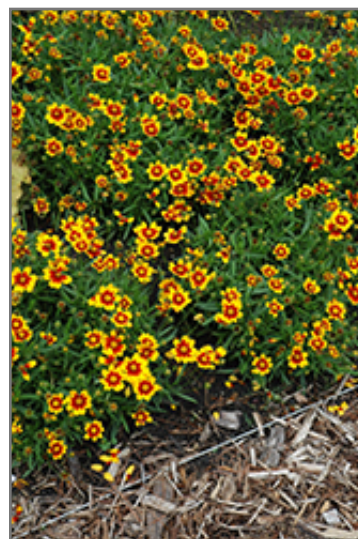
Lil' Bang Daybreak Tickseed in bloom