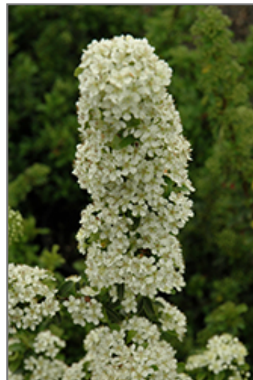
Teton Scarlet Firethorn flowers

Teton Scarlet Firethorn is recommended for the following landscape applications;