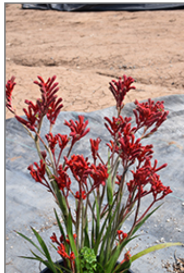
Kanga Red Kangaroo Paw in bloom