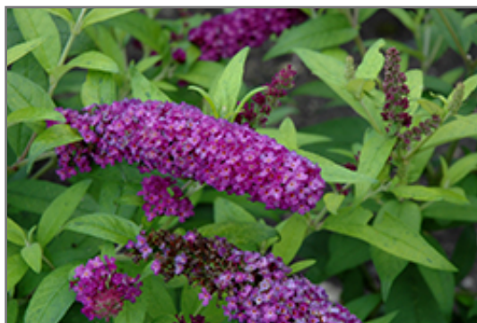
Monarch Crown Jewels Butterfly Bush flowers

This is a relatively low maintenance shrub, and is best pruned in late winter once the threat of extreme cold has passed. It is a good choice for attracting bees, butterflies and hummingbirds to your yard, but is not particularly attractive to deer who tend to leave it alone in favor of tastier treats. It has no significant negative characteristics.