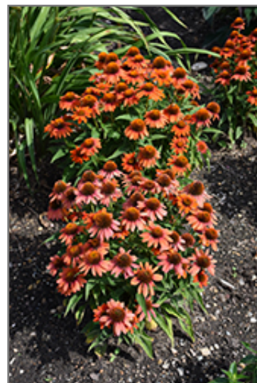
Sombrero Adobe Orange Coneflower in bloom