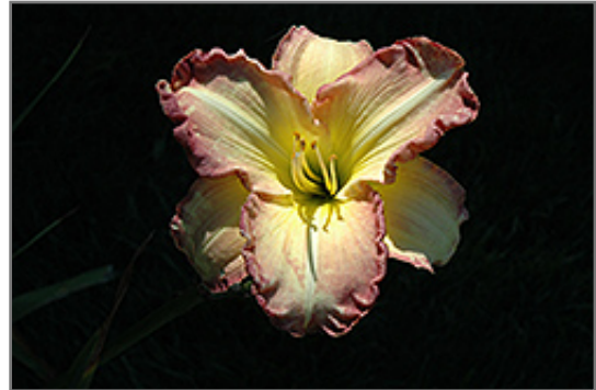
Swedish Girl Daylily flowers