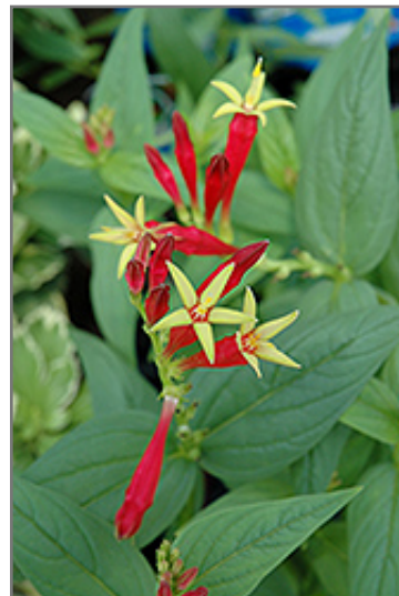
Indian Pink flowers

Indian Pink is recommended for the following landscape applications;