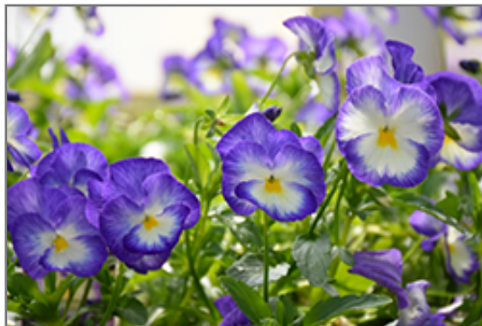
Halo Lilac Pansy flowers

This plant will require occasional maintenance and upkeep, and should only be pruned after flowering to avoid removing any of the current season's flowers. Deer don't particularly care for this plant and will usually leave it alone in favor of tastier treats. Gardeners should be aware of the following characteristic(s) that may warrant special consideration;