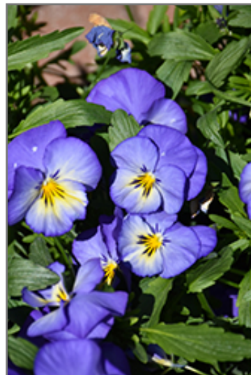
Halo Sky Blue Pansy flowers

This plant will require occasional maintenance and upkeep, and should only be pruned after flowering to avoid removing any of the current season's flowers. Deer don't particularly care for this plant and will usually leave it alone in favor of tastier treats. Gardeners should be aware of the following characteristic(s) that may warrant special consideration;