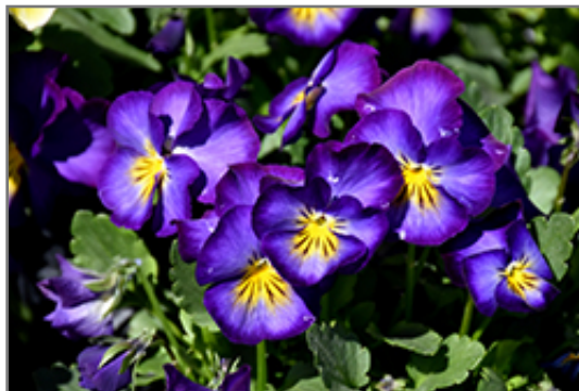
Halo Violet Pansy flowers

This plant will require occasional maintenance and upkeep, and should only be pruned after flowering to avoid removing any of the current season's flowers. Deer don't particularly care for this plant and will usually leave it alone in favor of tastier treats. Gardeners should be aware of the following characteristic(s) that may warrant special consideration;