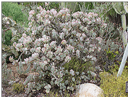
Silver Dollar Plant

Silver Dollar Plant is recommended for the following landscape applications;