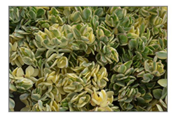
Variegated Jade Plant foliage Photo courtesy of NetPS Plant Finder

Variegated Jade Plant Photo courtesy of NetPS Plant Finder