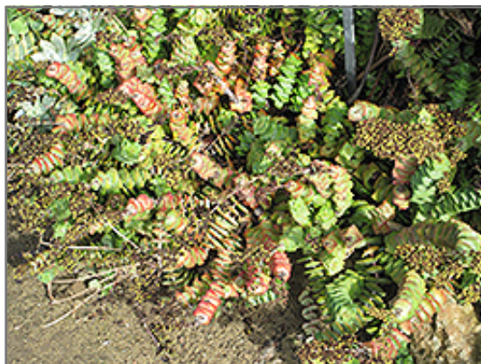
String Of Buttons

String Of Buttons is recommended for the following landscape applications;