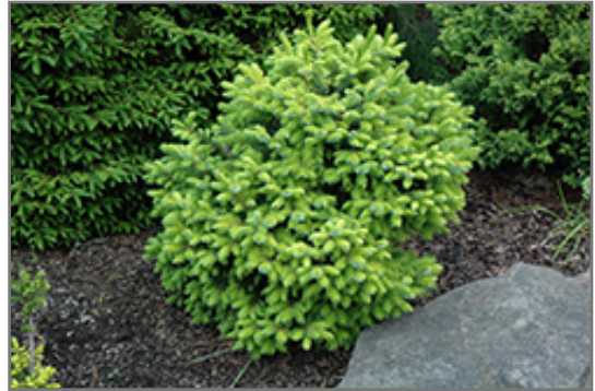
Peve Tijn Serbian Spruce in spring

This shrub should only be grown in full sunlight. It does best in average to evenly moist conditions, but will not tolerate standing water. It is not particular as to soil type or pH. It is quite intolerant of urban pollution, therefore inner city or urban streetside plantings are best avoided, and will benefit from being planted in a relatively sheltered location. This is a selected variety of a species not originally from North America.