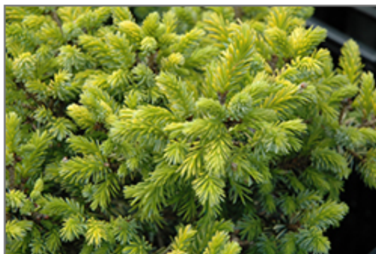
Peve Tijn Serbian Spruce foliage