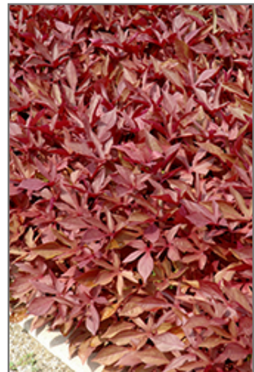
SolarPower Red Sweet Potato Vine