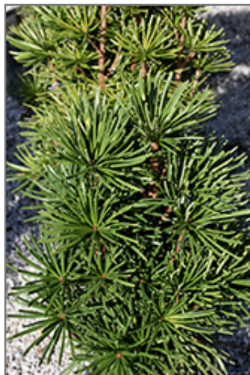
Green Star Umbrella Pine foliage