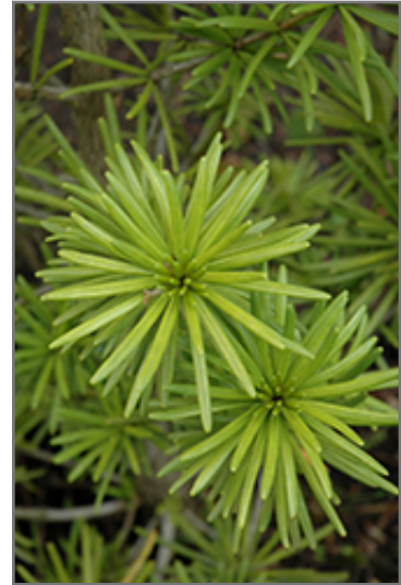
Green Star Umbrella Pine foliage

Green Star Umbrella Pine makes a fine choice for the outdoor landscape, but it is also well-suited for use in outdoor pots and containers. Its large size and upright habit of growth lend it for use as a solitary accent, or in a composition surrounded by smaller plants around the base and those that spill over the edges. It is even sizeable enough that it can be grown alone in a suitable container. Note that when grown in a container, it may not perform exactly as indicated on the tag - this is to be expected. Also note that when growing plants in outdoor containers and baskets, they may require more frequent waterings than they would in the yard or garden.