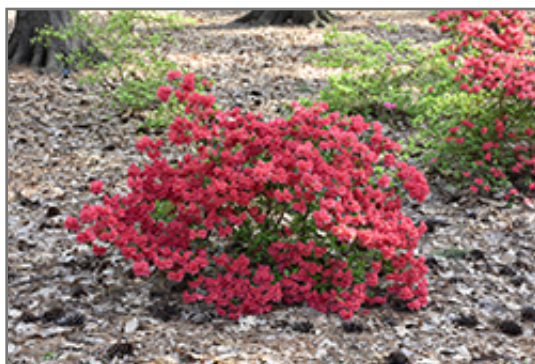
Girard's Crimson Azalea in bloom