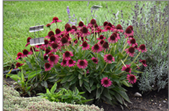
Delicious Candy Coneflower in bloom

Delicious Candy Coneflower will grow to be about 18 inches tall at maturity extending to 24 inches tall with the flowers, with a spread of 15 inches. It grows at a medium rate, and under ideal conditions can be expected to live for approximately 10 years. As an herbaceous perennial, this plant will usually die back to the crown each winter, and will regrow from the base each spring. Be careful not to disturb the crown in late winter when it may not be readily seen!