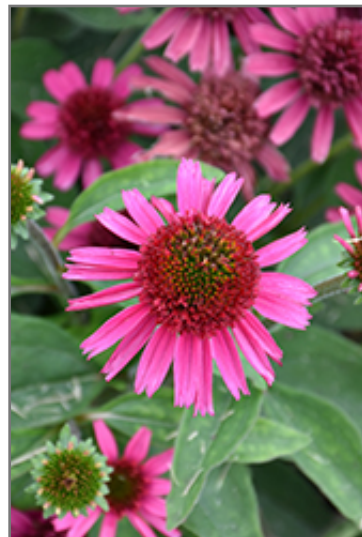
Delicious Candy Coneflower flowers

This is a relatively low maintenance plant, and is best cleaned up in early spring before it resumes active growth for the season. It is a good choice for attracting butterflies to your yard, but is not particularly attractive to deer who tend to leave it alone in favor of tastier treats. It has no significant negative characteristics.