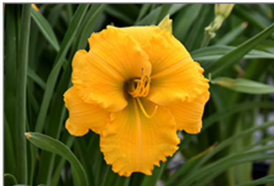
Elegant Explosion Daylily flowers