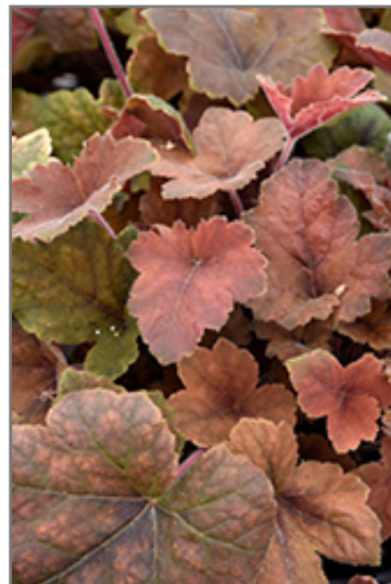
Pumpkin Spice Foamy Bells foliage

Pumpkin Spice Foamy Bells is recommended for the following landscape applications;