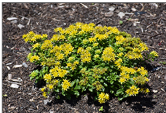
Little Miss Sunshine Stonecrop in bloom