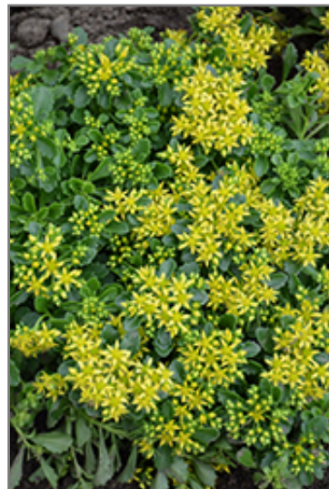
Little Miss Sunshine Stonecrop flowers

Little Miss Sunshine Stonecrop is recommended for the following landscape applications;