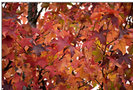
Sweet Gum in fall