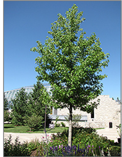
Sweet Gum

This tree should only be grown in full sunlight. It prefers to grow in average to moist conditions, and shouldn't be allowed to dry out. It is very fussy about its soil conditions and must have rich, acidic soils to ensure success, and is subject to chlorosis (yellowing) of the foliage in alkaline soils. It is somewhat tolerant of urban pollution. This species is native to parts of North America.