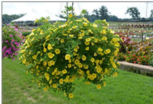
MiniFamous Neo Deep Yellow Calibrachoa in bloom