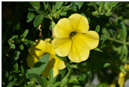
MiniFamous Neo Deep Yellow Calibrachoa flowers

MiniFamous Neo Deep Yellow Calibrachoa is a dense herbaceous annual with a trailing habit of growth, eventually spilling over the edges of hanging baskets and containers. Its medium texture blends into the garden, but can always be balanced by a couple of finer or coarser plants for an effective composition.