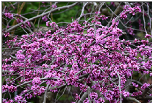
Traveller Weeping Redbud flowers

Traveller Weeping Redbud is a multi-stemmed deciduous shrub with a rounded form and gracefully weeping branches. Its relatively coarse texture can be used to stand it apart from other landscape plants with finer foliage.