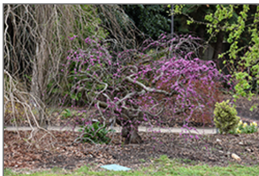
Traveller Weeping Redbud in bloom