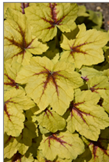
Catching Fire Foamy Bells foliage