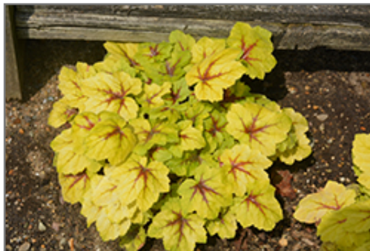
Catching Fire Foamy Bells

Catching Fire Foamy Bells is a dense herbaceous evergreen perennial with tall flower stalks held atop a low mound of foliage. Its medium texture blends into the garden, but can always be balanced by a couple of finer or coarser plants for an effective composition.