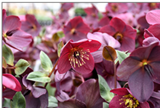
HGC Ice N' Roses Red Hellebore flowers