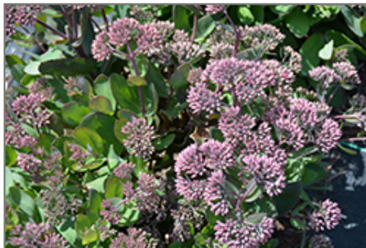
Thunderhead Stonecrop flower buds

This is a relatively low maintenance plant, and is best cleaned up in early spring before it resumes active growth for the season. It is a good choice for attracting bees and butterflies to your yard, but is not particularly attractive to deer who tend to leave it alone in favor of tastier treats. It has no significant negative characteristics.