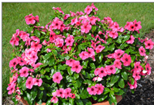
Tattoo Raspberry Vinca in bloom