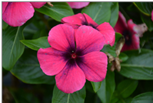
Tattoo Raspberry Vinca flowers

Tattoo Raspberry Vinca is a dense herbaceous annual with a mounded form. Its medium texture blends into the garden, but can always be balanced by a couple of finer or coarser plants for an effective composition.