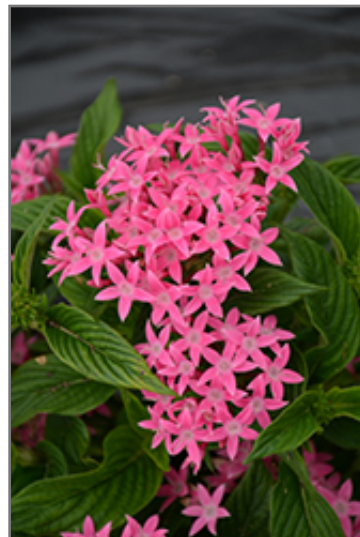
Lucky Star Pink Star Flower flowers