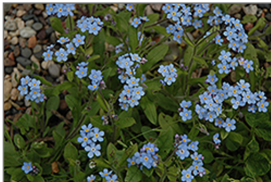
Forget-Me-Not flowers