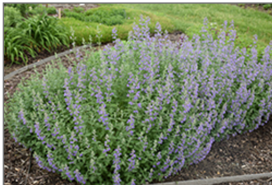
Walker's Low Catmint in bloom

Walker's Low Catmint is recommended for the following landscape applications;