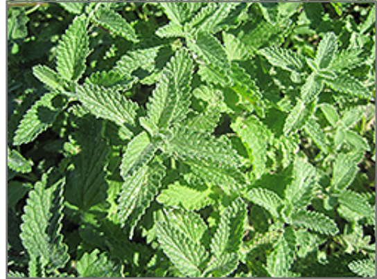
Walker's Low Catmint foliage

Walker's Low Catmint will grow to be about 12 inches tall at maturity extending to 16 inches tall with the flowers, with a spread of 12 inches. Its foliage tends to remain dense right to the ground, not requiring facer plants in front. It grows at a fast rate, and under ideal conditions can be expected to live for approximately 10 years. As an herbaceous perennial, this plant will usually die back to the crown each winter, and will regrow from the base each spring. Be careful not to disturb the crown in late winter when it may not be readily seen!