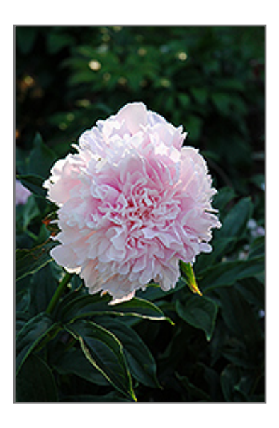
Dinner Plate Peony flowers

Dinner Plate Peony will grow to be about 30 inches tall at maturity, with a spread of 3 feet. When grown in masses or used as a bedding plant, individual plants should be spaced approximately 30 inches apart. The flower stalks can be weak and so it may require staking in exposed sites or excessively rich soils. It grows at a slow rate, and under ideal conditions can be expected to live for approximately 20 years. As an herbaceous perennial, this plant will usually die back to the crown each winter, and will regrow from the base each spring. Be careful not to disturb the crown in late winter when it may not be readily seen!