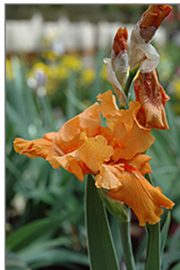
Firebreather Iris flowers