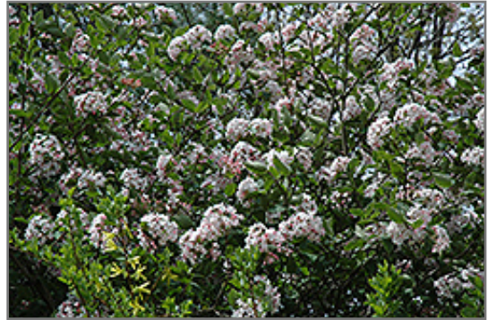
Judd's Viburnum flowers

Judd's Viburnum will grow to be about 7 feet tall at maturity, with a spread of 7 feet. It tends to fill out right to the ground and therefore doesn't necessarily require facer plants in front, and is suitable for planting under power lines. It grows at a medium rate, and under ideal conditions can be expected to live for 40 years or more.