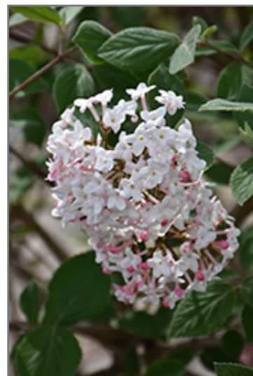
Judd's Viburnum flowers

This is a relatively low maintenance shrub, and should only be pruned after flowering to avoid removing any of the current season's flowers. It is a good choice for attracting birds to your yard, but is not particularly attractive to deer who tend to leave it alone in favor of tastier treats. It has no significant negative characteristics.