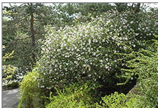
Judd's Viburnum in bloom