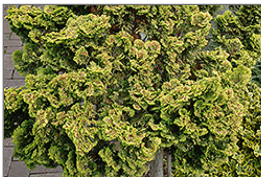
Dwarf Golden Hinoki Falsecypress foliage