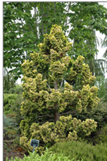
Dwarf Golden Hinoki Falsecypress