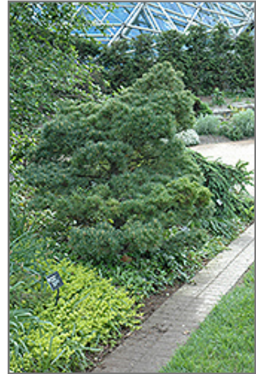
Macopin Eastern White Pine

This shrub should only be grown in full sunlight. It is very adaptable to both dry and moist growing conditions, but will not tolerate any standing water. It is not particular as to soil type, but has a definite preference for acidic soils, and is subject to chlorosis (yellowing) of the foliage in alkaline soils. It is quite intolerant of urban pollution, therefore inner city or urban streetside plantings are best avoided, and will benefit from being planted in a relatively sheltered location. This is a selection of a native North American species.