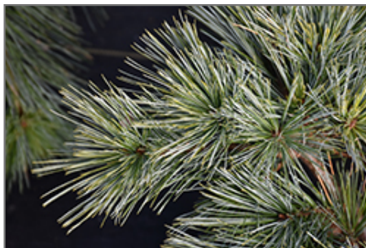
Macopin Eastern White Pine foliage