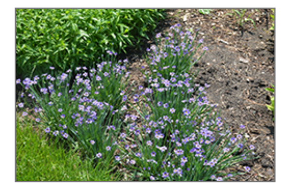
Lucerne Blue-Eyed Grass in bloom