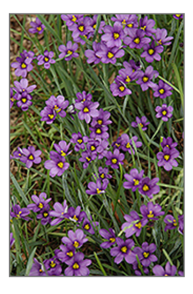
Lucerne Blue-Eyed Grass flowers

Lucerne Blue-Eyed Grass is an herbaceous perennial with an upright spreading habit of growth. Its medium texture blends into the garden, but can always be balanced by a couple of finer or coarser plants for an effective composition.