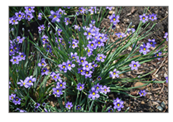
Lucerne Blue-Eyed Grass flowers

Lucerne Blue-Eyed Grass is a fine choice for the garden, but it is also a good selection for planting in outdoor pots and containers. It is often used as a 'filler' in the 'spiller-thriller-filler' container combination, providing a mass of flowers and foliage against which the larger thriller plants stand out. Note that when growing plants in outdoor containers and baskets, they may require more frequent waterings than they would in the yard or garden.