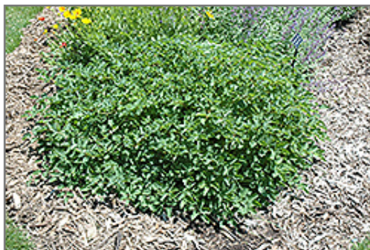
Japanese Bottlebrush