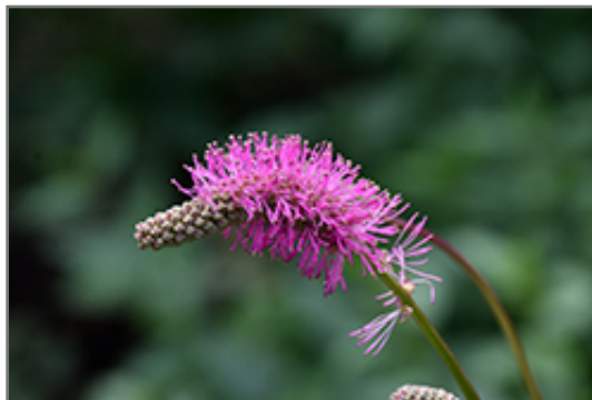
Japanese Bottlebrush flowers

Japanese Bottlebrush is recommended for the following landscape applications;