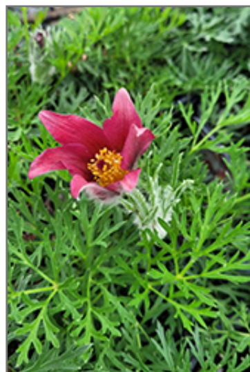
Red Pasqueflower flowers