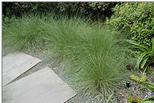
Hairawn Muhly

This is a relatively low maintenance plant, and is best cleaned up in early spring before it resumes active growth for the season. Deer don't particularly care for this plant and will usually leave it alone in favor of tastier treats. It has no significant negative characteristics.