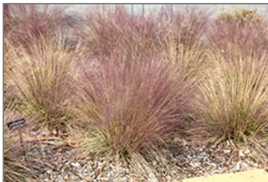
Hairawn Muhly in fall